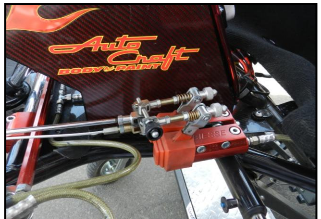
Its' in the details.....